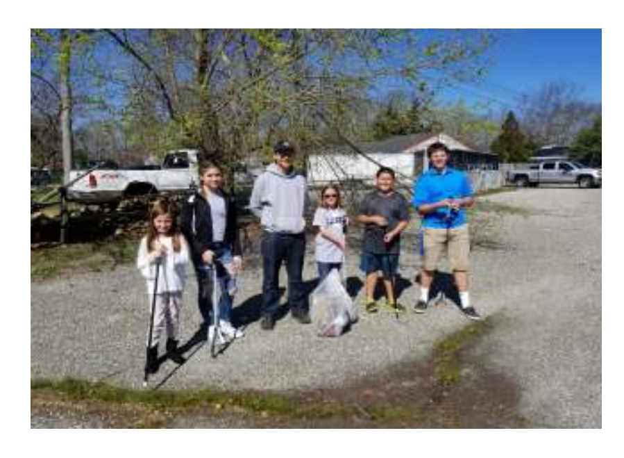
EARTH DAY CLEANUP WITH THE YOUTH GROUP